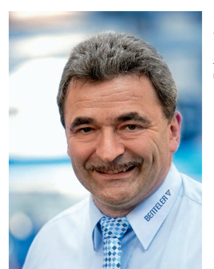
»Performance needs passion. We know where to position the lever! «